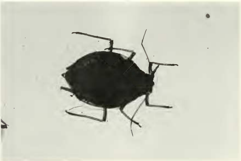
Fig. 6. Cotype of Kakimia mimulicola , slide from Essig Collection at U.C. Berkeley (6.25 \times ).

Kakimia mimulicola Drews and Sampson 1937 was described from Mimulus sp. (Scrophulariaceae). The short, distinctly shaped cauda, W-shaped front and rhinarial